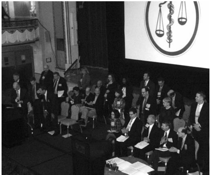
Bird's eye view of the splendor of the "high table."