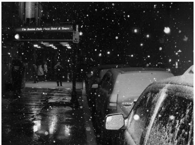
Run! Hide! The nor'easter is coming.