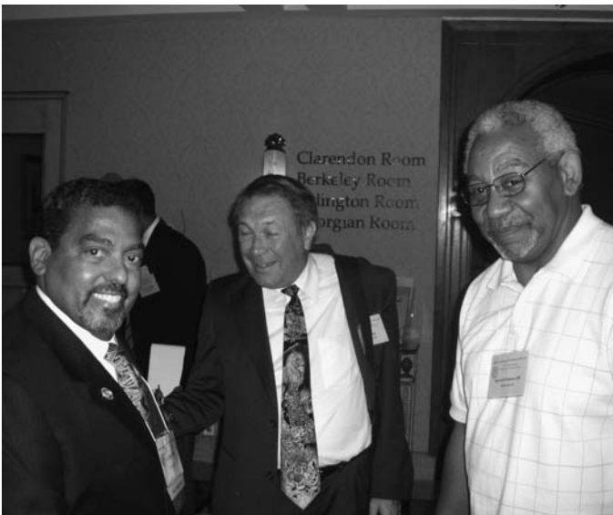
Catching up with friends from around the world at break-times.