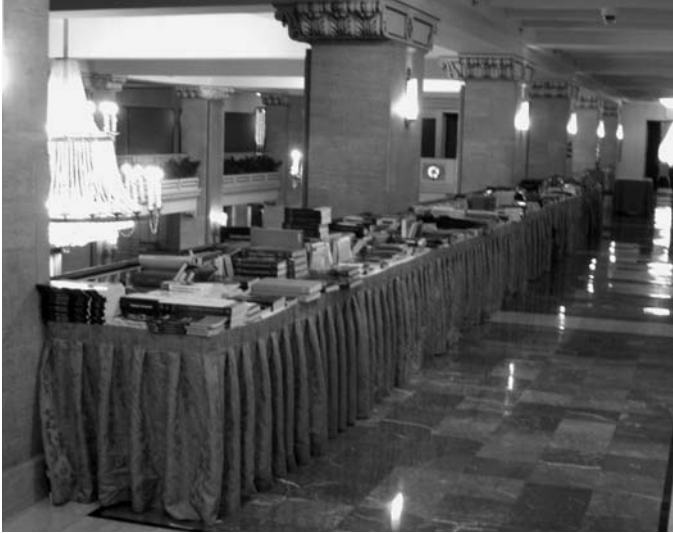
A rare quiet moment at the bookstand.